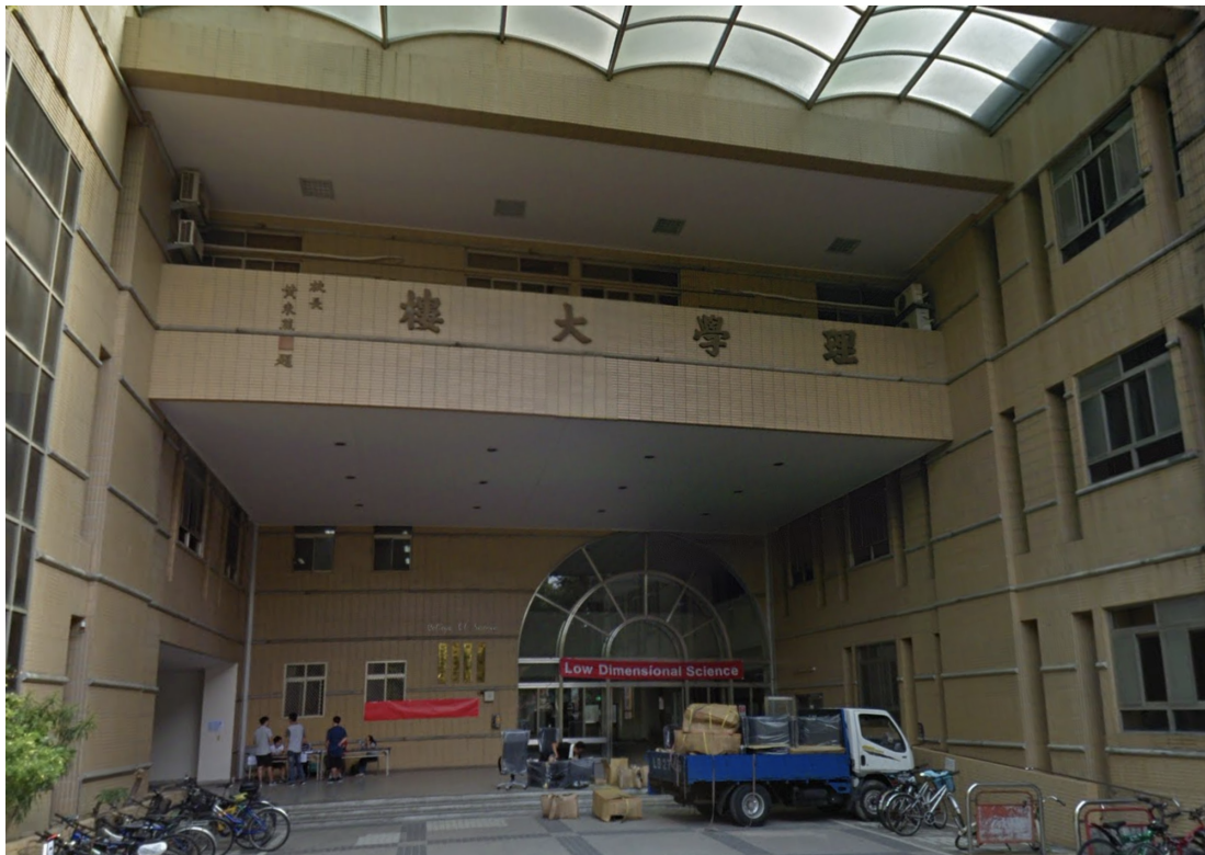
Figure 2: Meeting Point – Science College Building Main Gate