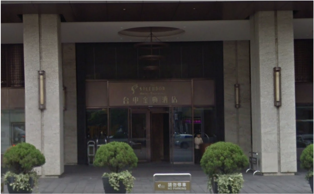
Figure 1: Meeting Point – Splendor Hotel Main Gate