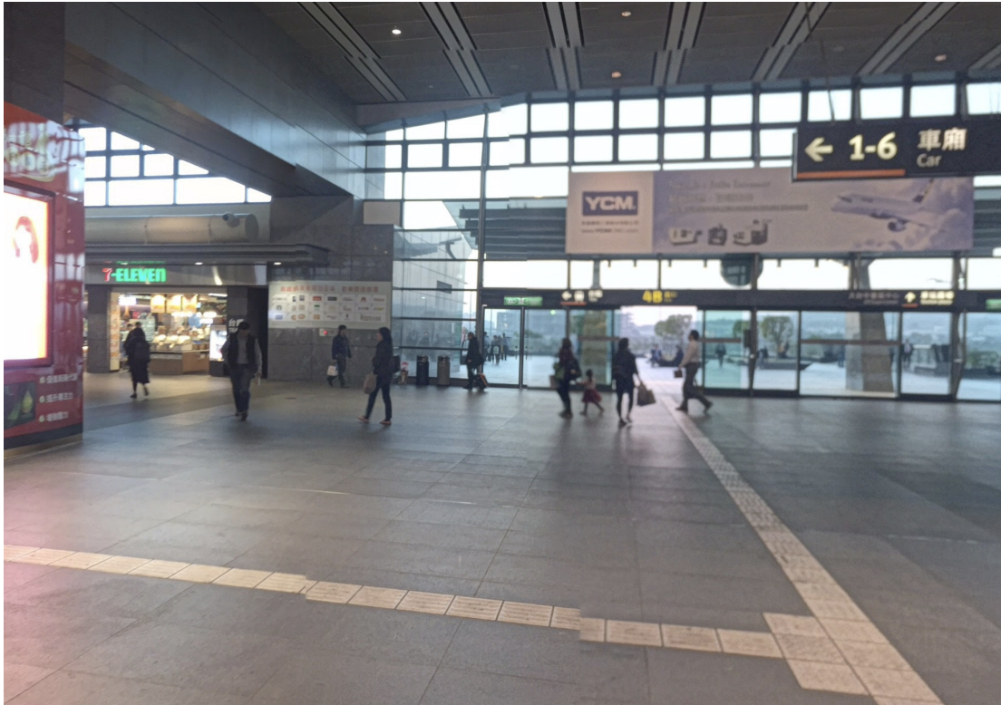
Figure 3: Meeting Point – High Speed Rail Station 4B Exit (2F)